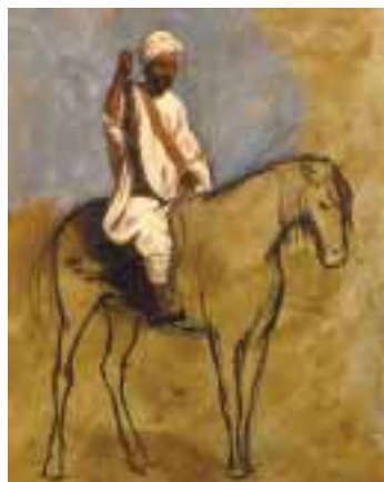
CLOCKWISE FROM TOP: ZHUANG HONG YI, UNTTITLED, 2019; PETER SCHUYFF, UNTTITLED, 1986. © THE ARTIST; EDWIN LORD WEEKS. STUDY OF A MOUNTED ARAB WARRIOR; SHIRIN NESHAT, MANUEL MARTINEZ, FROM LAND OF DREAMS SERIES. COURTESY THE ARTIST AND GOODMAN GALLERY

Collectors, curators and art lovers from around the world will be able to explore many of the capital's most illustrious art galleries during London Art Week's summer edition, with a series of shows and talks taking place from July 2 to 10. More than 40 international dealers and auction houses will offer art at locations across Mayfair and St James's. londonartweek.co.uk