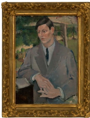
4 Win the primaries – Franco Fontana, Los Angeles , 1990, at Atlas. 5 Ahead of the carve – Grinling Gibbons, All Hallows font cover , 1682, at Bonhams. 6 Brother's keeper – Alberto Ziveri, Fratello Ernesto , 1933, at Massimo de Carlo. 7 Feeling wired – Almuth Tebbenhoff, Cherry Blossom Drop , 2001, at Royal Society of Sculptors